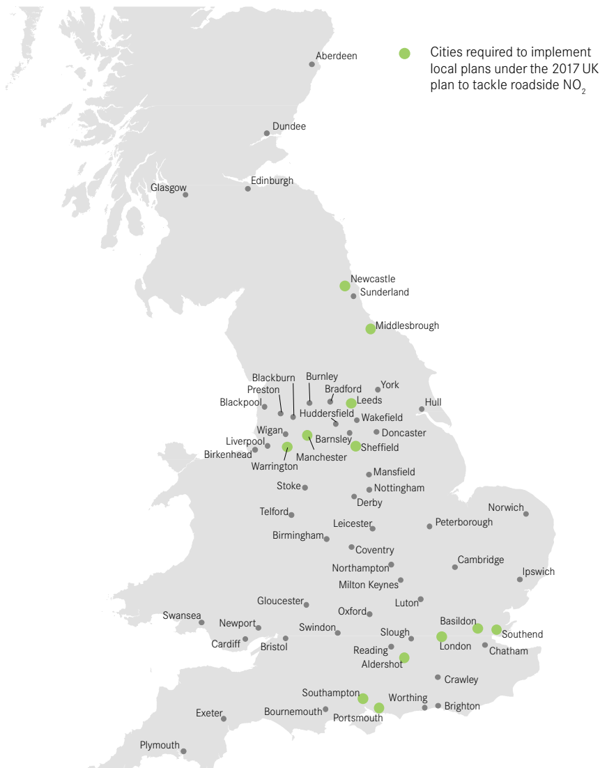
Figure 3: Cities required to take action by the July 2017 plan